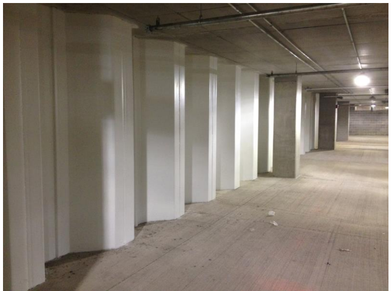
Parking Garage – Sheetpile Wall

The sheetpile wall serves a dual purpose in that it serves as the permanent basement wall for the two-story underground parking garage. After the excavation was complete the wall was sandblasted and painted as shown in the photo of the underground garage.